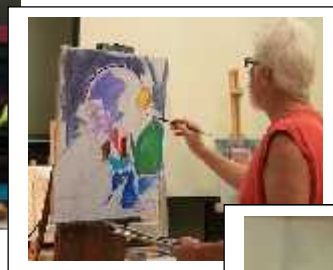
Beginning with mid tones