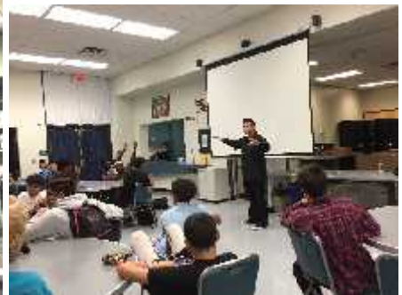
Planning meeting with students