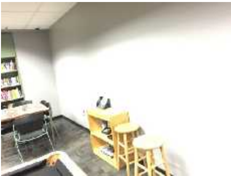
Other half of blank wall