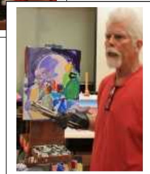
Blocked in demo painting