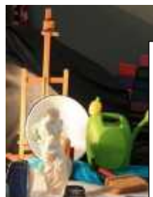
The Still Life

He closed with the challenge that one is never too old to create and to paint. He said that Lucien Freud painted into his 80's and Henry Hensche painted until he died in his 90's.