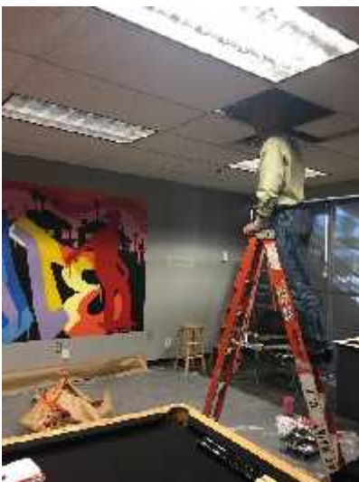
DP Electrics flood light installation.