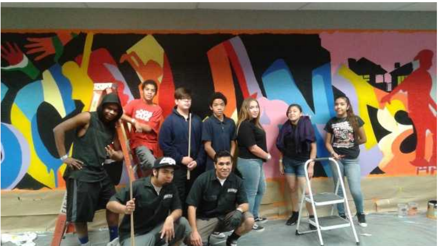
Such Styles with some of the student painters.