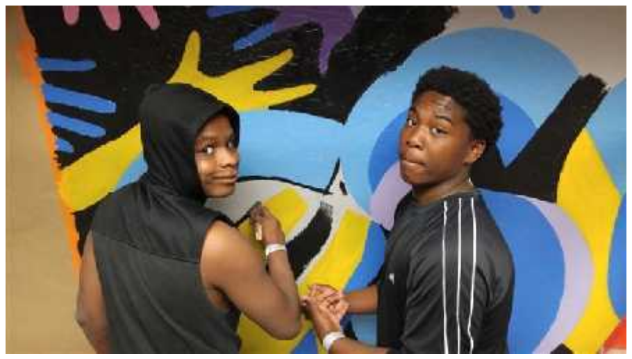
Two students working on the TAG/Escalante Outreach Project

Future Newsletter Deadlines: 6/15/17; 8/22/17; and 12/22/17.